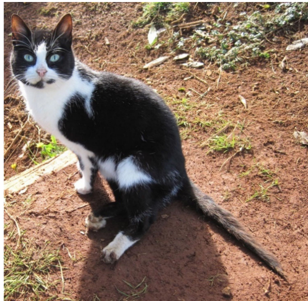
Figure 1. A domestic cat ( Felis catus ) with paraparesis due to Gurltia paralysans infection.