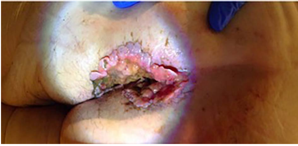
Figure 1: Photograph of the perianal lesion on presentation.