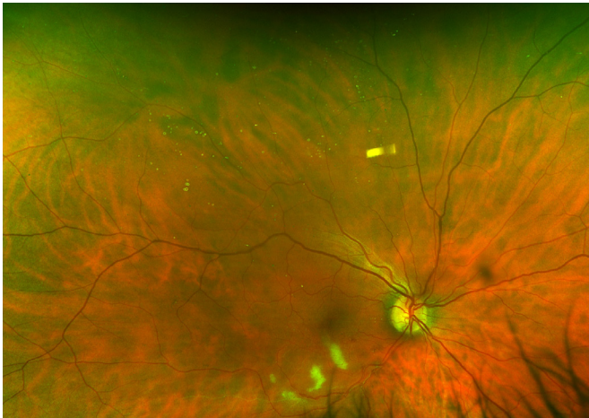
Figure 1 Wide-field retinal image of the right eye of a patient with branch retinal vein occlusion who complained about floaters after the very first anti-VEGF injection. The patient had no posterior vitreous detachment, and intravitreal silicone droplets could be seen in front of the retina, scattered over much of the upper hemisphere. VEGF, vascular endothelial growth factor.

the prevalence of non-symptomatic SiO and evaluate the effect of shifting to SiO-free syringes for IVI.