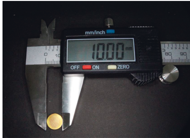
FIGURE 2: Gold-colored anodized titanium.