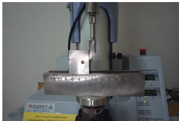
FIGURE 3: SBS test with a universal testing machine.

group) (G*Power 3.1.9.4; Department of Psychology, Christian-Albrechts-University, Kiel, Germany). The Shapiro–Wilk test was used to check for a normal distribution before statistical analysis of the data using one-way ANOVA (SPSS 21.0, SPSS, Inc., Chicago, IL, USA). For multiple comparisons, Tukey’s post hoc test was used with a significance level of 0.05 ( \alpha = 0.05 ).