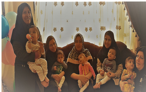
Fig. 3 Picture 2: quintuplet at one year

Maintaining the health of the infants imposed high charges on the health system, a part of which was compensated by Isfahan University of Medical Sciences affiliated departments or by the Welfare Organization. Some of the authorities also helped the families in cash in the form of present credit cards during their occasional visits.