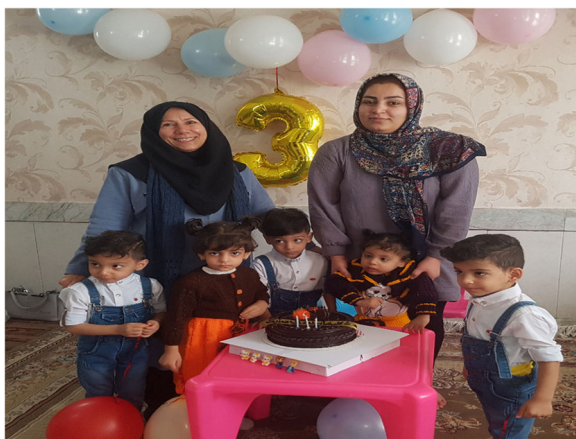
Fig. 5 Picture 4: quintuplet at age of three (Namnabati, Isfahan University of Medical Sciences, Isfahan, Iran, 2020)

Preterm delivery has inevitable consequences such as nutrition disorders and infection. Families may also encounter some problems like audible, speech, and different ratings of vision in their infants. In a study conducted in the infant wards of Tehran University of Medical Sciences, it was shown that 12% of 99 multifetal infant samples of the study aging 4–9 weeks suffered retinopathy [19]. Therefore, based on the considerable points of Table 2, proper decisions should be made in this regard.