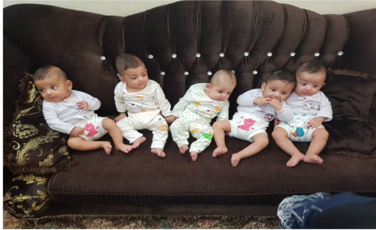
Fig. 2 Picture 1: quintuplet at age of 8 months (Namnabati, Isfahan University of Medical Sciences, Isfahan, Iran.2020)