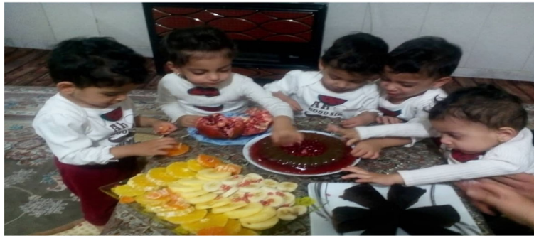
Fig. 4 Picture 3: quintuplet at age of two (Namnabati, Isfahan University of Medical Sciences, Isfahan, Iran, 2020)

neither could the infants be taken out of their room nor could the caregiver enter the room easily. In an interview the mother said: