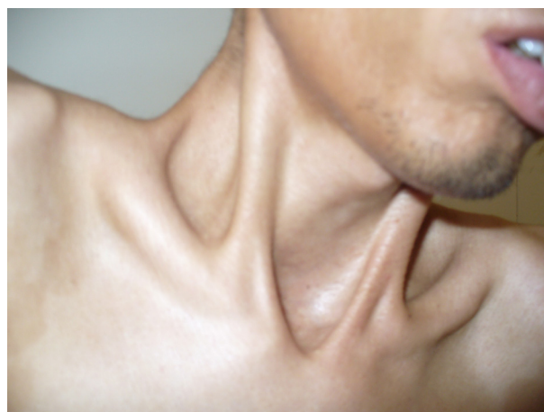
Figure 1. A 28-year-old man with progressive ossification of neck muscles.

Guy Patin first described FOP in 1648 in a young man who "turned to wood". The autosomal dominant inheritance of FOP was first described by Sympson in a case report of a seven-year-old boy with classic features of FOP (6, 7).