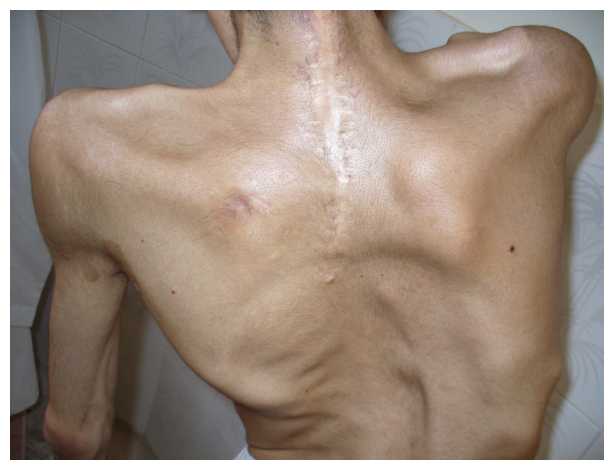
Figure 2. Body deformity and incision lines on the back of the patient after surgical procedures