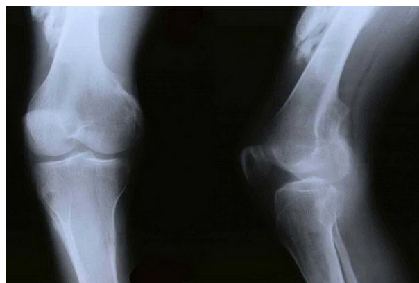
Figure 3. Lower limb radiographs showed ectopic ossification in the quadriceps muscle.