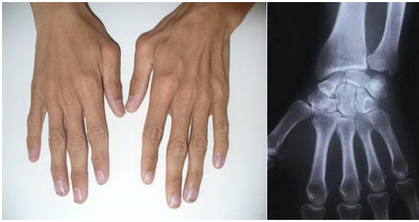
Figure 4. Hand radiograph and photograph showed shortening of the first phalynx of the thumb.