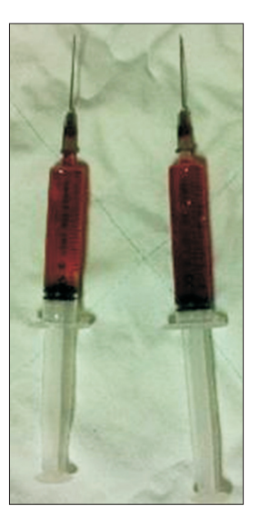
Fig. 3. Initially a 10 mL of dark red-colored liquid was drained from the calf.