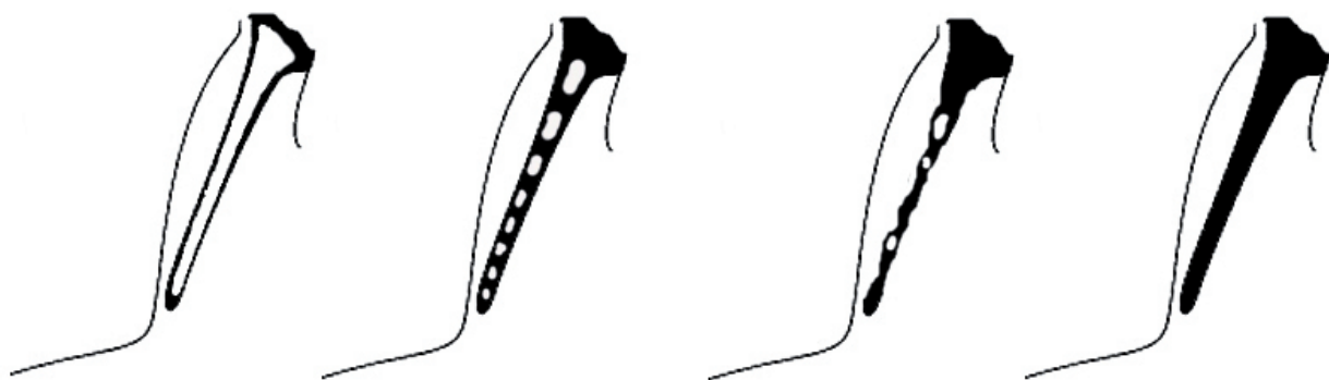
Fig. 3. Schematic representation of calcification patterns of styloid process.