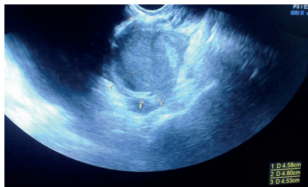
Figure 2. Endometrium of the left ovary