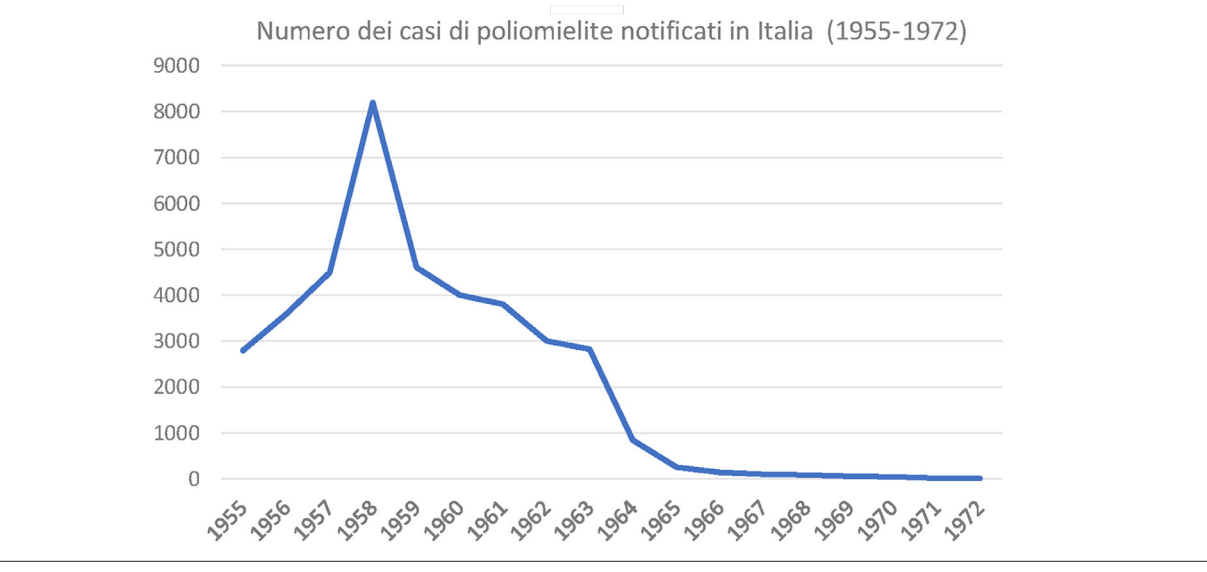
Fig. 4. Cases of polio reported in Italy between 1955 and 1972. In 1964, the year when vaccination with OPV started, the number of cases dropped from 2830 to 842 and never rose again.

But in such a vital project as that of a mass vaccination campaign, efficient communication is also essential. Indeed, in 1964, Minister Mancini categorically stated that the most important factor in the success of the vaccination program was that of information. Mancini therefore supervised this phase himself, making personal appeals to health officials, doctors, mayors and