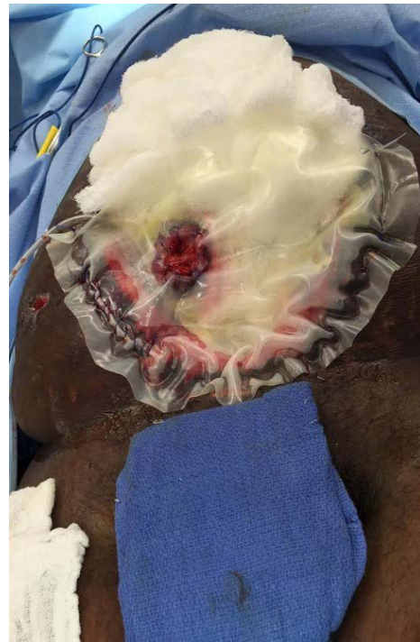
Figure 1 Floating stoma: ostomy and wound edges sutured to saline bag.

Tube vac system first described in 2008 combines the use of negative pressure vacuum with Malecot drains (figure 2). 9 Unlike simple intubation of the fistula, which was not met with success in our study, the tube vac system was highly effective but tedious. The EAF is intubated with an appropriately sized drain, the mass of bowel is then covered with white foam followed by typical black sponge and the drain run through an opening created in the sponge. The presumed mechanism by which this technique is thought to be effective is twofold; the first being the negative pressure aids in the formation of granulation tissue, and second by creating a seal around the tube allowing preferential flow of enteric contents through the drain.