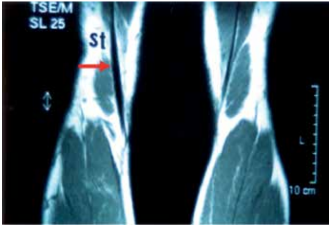
Figure 2. Magnetic resonance image of the knee: coronal section. Turbo spin-echo sequence: T1-weighted. Arrow: Regenerated semitendinosus tendon.