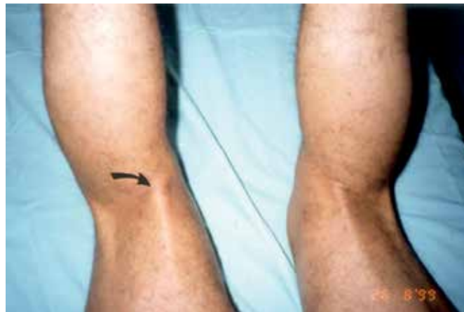
Figure 1. Visualization of the semitendinosus and/or gracilis tendons on physical examination, with knee flexion against resistance. Arrow: Regenerated tendons in the posterior medial aspect of the knee.

The results of these examinations were evaluated by two experienced radiologists who were specialists in musculoskeletal imaging. Discrepancies between the radiologists were resolved by consensus,