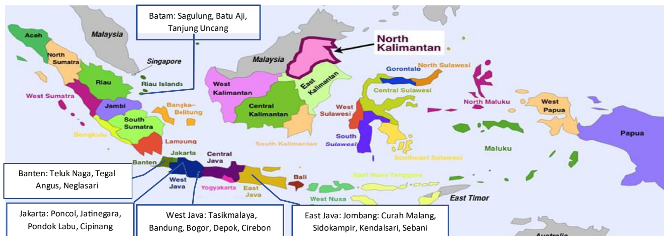
Figure 2. Dispersion of informal e-waste businesses throughout Indonesia.

Following these processes, this research highlighted twenty measures that belong to the benefit, while ten measures provide