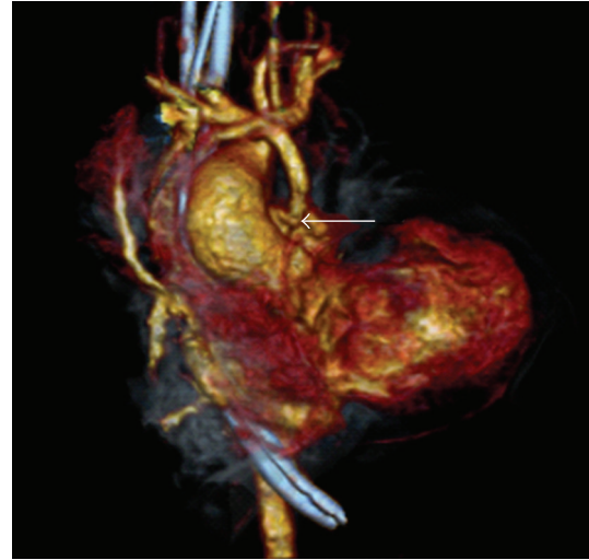
FIGURE 2: CT angiography with 3-dimensional reconstruction demonstrating a narrowing of the modified BT shunt at the point of anastomosis with the pulmonary artery.

Diagnosing postoperative complications following surgery for congenital heart disease can be challenging in the setting