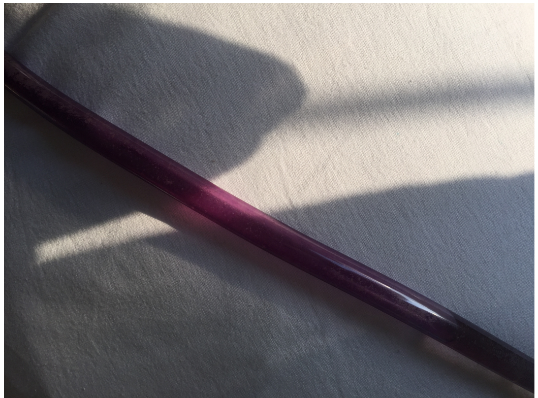
FIGURE 2: Purple urine in catheter tube.