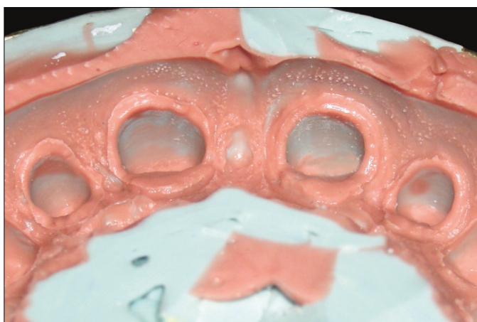
Fig. 1. Final impression in polyvinyl-siloxane.

Kalabhai Karson, Mumbai, India). The cast was retrieved from the impression after setting of the gypsum material (Fig. 4). The polymethylmethacrylate based resilient liner could be easily separated from the silicone-based impression; hence, the separating medium was not required before pouring. The cast was examined for the defects or porosities. The resultant cast was produced with facial and proximal gingival surfaces in resilient liner material and rest of the cast in gypsum material. This soft tissue cast was used along with master cast to develop and evaluate ideal axial contours of the fixed partial denture (Fig. 5, 6).