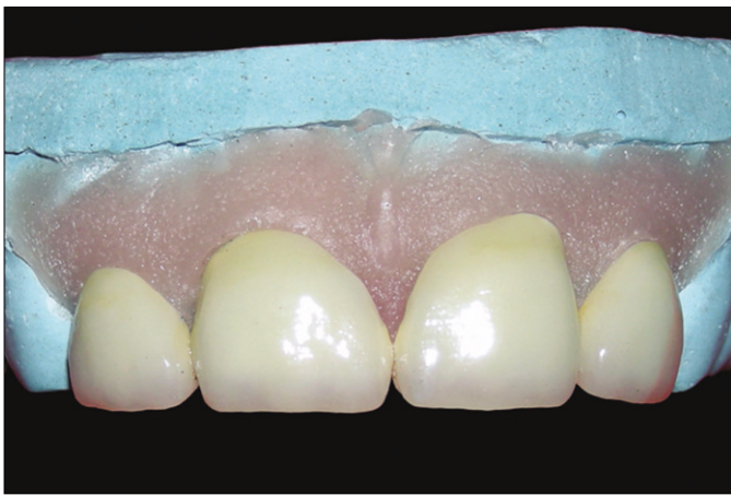
Fig. 5. Fabrication and evaluation of axial contours of the fixed partial denture on the modified soft tissue cast.