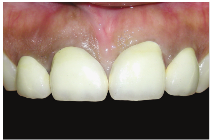
Fig. 6. Fixed partial denture in place with correct gingival emergence profile.