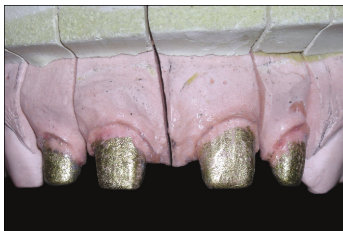
Fig. 2. Master cast.