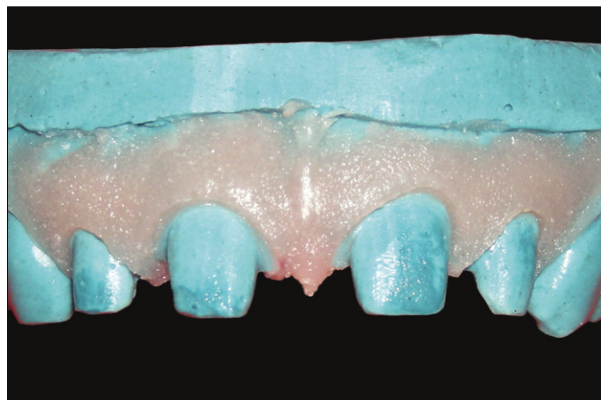
Fig. 4. Modified soft tissue cast.