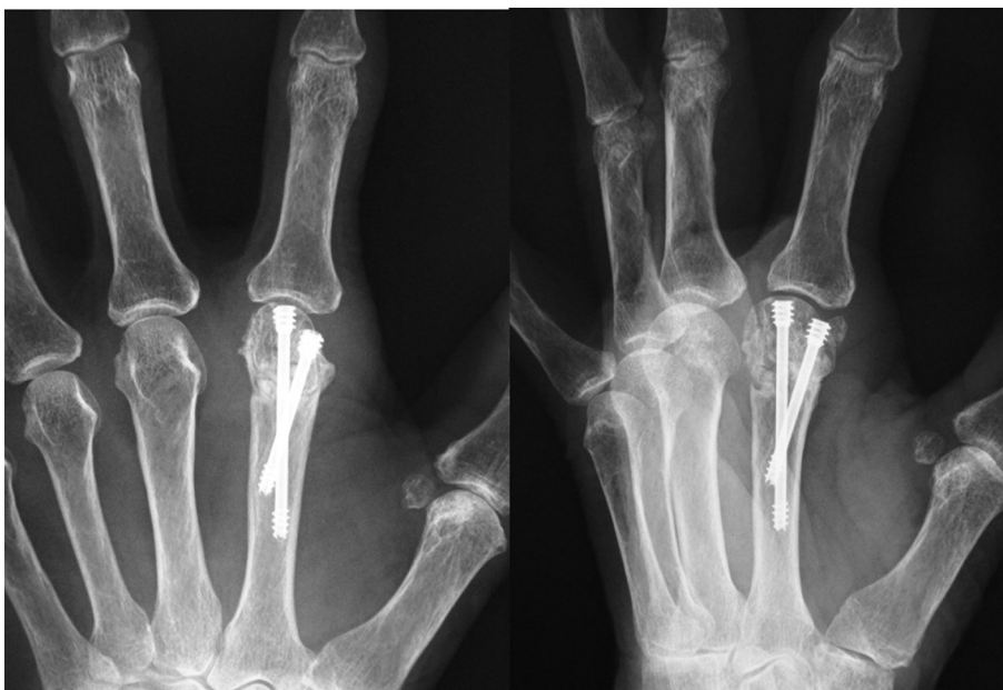
Fig. 4. Radiography at 4 months postoperatively showing bone union without an indication of avascular necrosis.