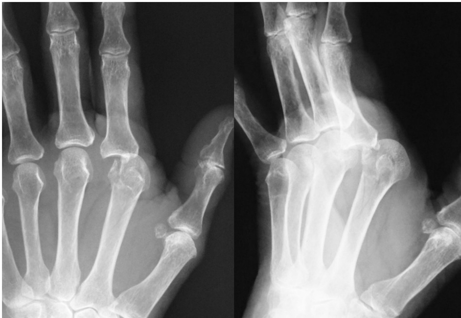
Fig. 1. Radiography showing dorsal dislocation of the MP joint.

was fitted into the metacarpal neck (Figs. 2, 3).