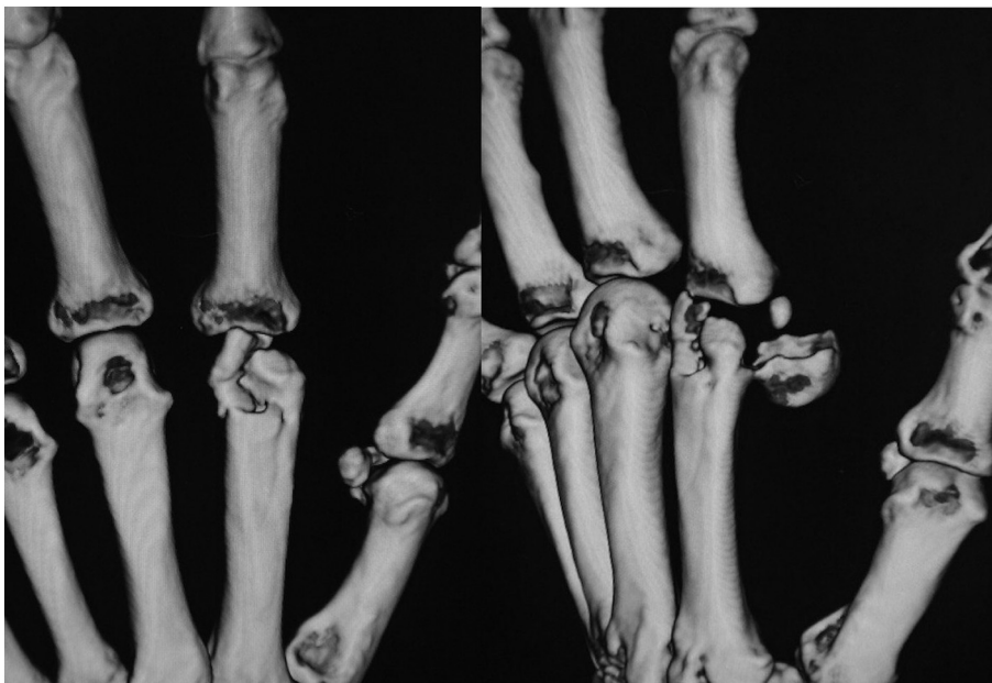
Fig. 3. Three-dimensional computed tomography reconstruction after closed reduction.