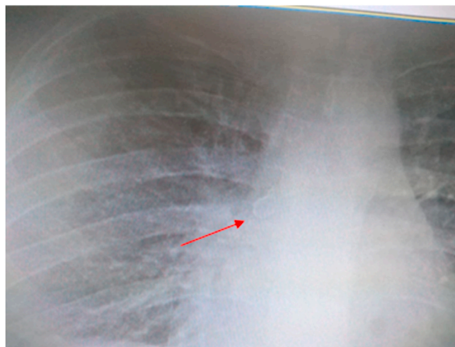
Fig. 2. A round opacity showing in the right main bronchus (arrow head) on chest X-ray.

Due to the pandemic prevalence of COVID-19 and the large number of patients referred to medical centers with clinical suspicion of COVID-19, the patient was admitted to the infectious service, where his disease