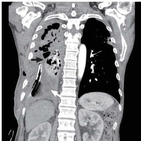
Fig. 5. Two weeks postoperatively, a chest computed tomography scan shows the pleural space filled by the intrathoracic transposition of the latissimus dorsi muscle flap (white arrow). A chest computed tomography scan of the right upper lobe shows pneumonia (black arrow).

adduction, and internal rotation of the shoulder joint, it does not function independently. Since it moves in synchrony with a number of synergistic shoulder girdle muscles, the LD muscle can be sacrificed safely without affecting shoulder or arm action [5].