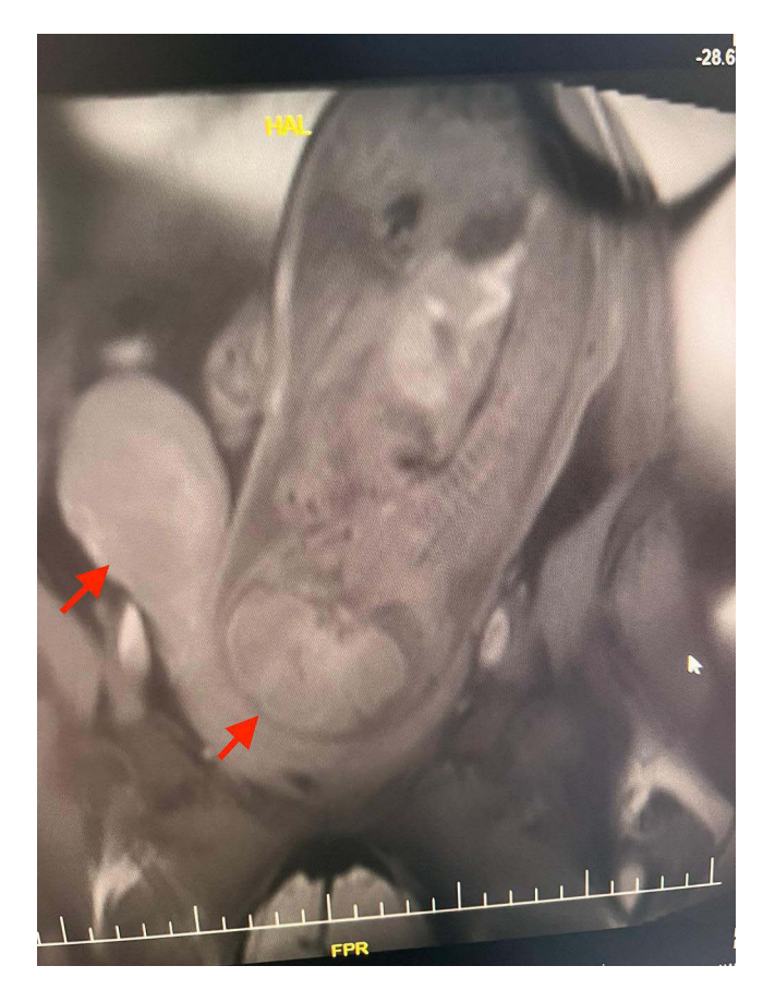
Figure 2 Magnetic resonance image showing two adjacent noncommunicating uteri (arrows), one of which is empty and the other is bearing a fetus.