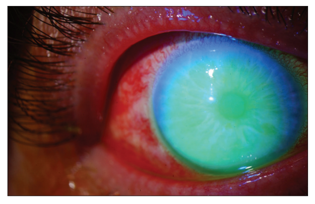
Figure 2 Same patient as Fig. 1, after fluorescein staining.