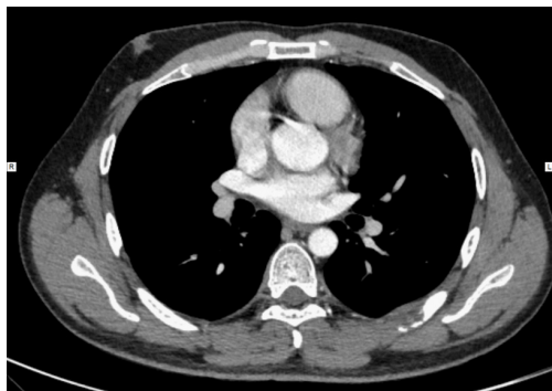
Figure 1 Enhanced CT scan of the patient's chest.

A 34-year-old male was referred to Tianjin Chest Hospital on May 31, 2016 due to persistent stabbing pain in the left chest and back for 45 days. The pain increased after bending, and was accompanied by chest tightness, shortness of breath, and night sweats, with no chills, fever, or fatigue, and no obvious inducements. The patient reported a history of otherwise good health, with no chronic or infectious disease or significant family history. Chest enhanced CT