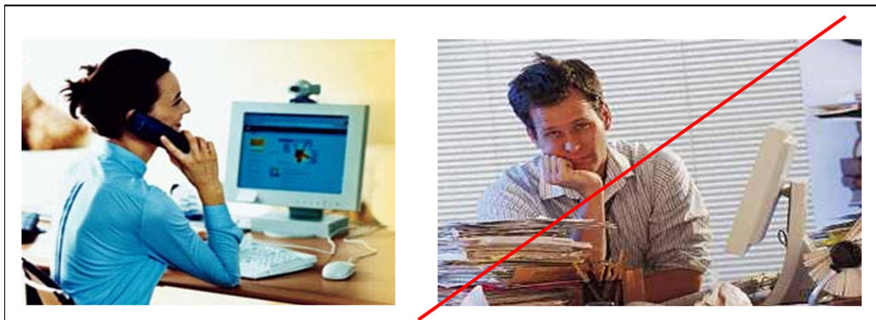
Figure 1 Symptoms and typical attitude of individuals with Vasospastic Syndrome: individuals with primary vasospastic deregulation tend to a meticulous personality and successful professional career such as the young female on the left image [2]