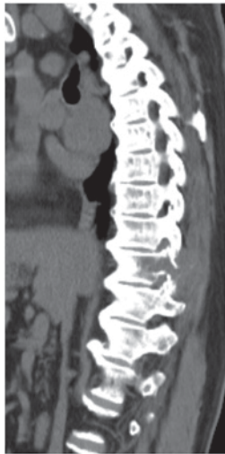
Figure 1. A CT scan on a female patient with osteochondroma aged 42 years shows that the boundary is blurry and irregular, and that calcification is generated in the lesion.

voltage: 120 kV; layer thickness: 5 mm; interlayer spacing: 1 mm; matrix: 512x512. The scanning was conducted on the spine with lesions and the adjacent vertebral body. An enhanced scan was conducted with iohexol [produced by Guangzhou Schering Pharmaceutical Co., Ltd., Guangzhou, China, concentration: 300 mg I/ml], a non-ionic iodine-containing contrast agent, in a dose of 1.5 ml/kg (body weight) by bolus injection with a high-pressure syringe in the same method as plain scan.