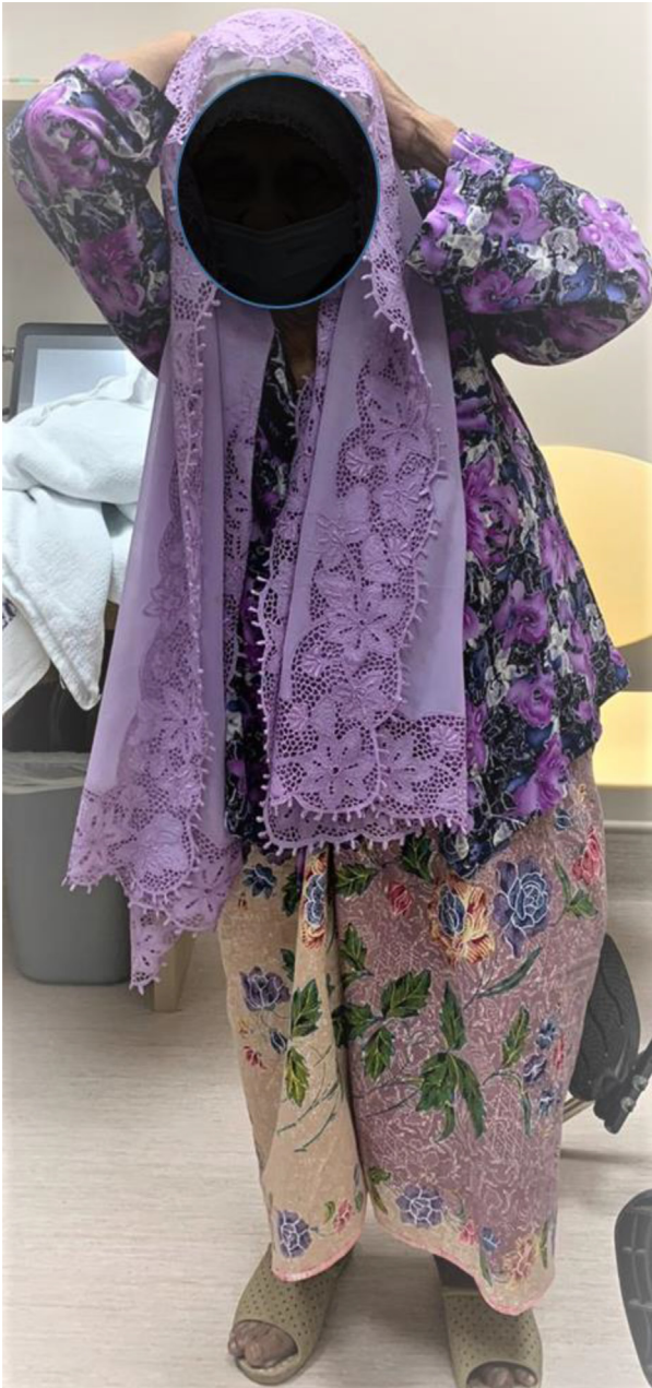
Fig. 3. Clinical photo of patient done at three months review showing patient back to her baseline left shoulder functions. She was able to flexed actively up to 60 degrees and was able to reach the back of her head.

scan of her left shoulder also collaborated with this recommendation, showing combined thickness of her subcutaneous tissue and deltoid bulk between 16.5 mm and 20.0 mm taken at levels 5–8 cm from the lateral acromion border. Nakajima et al. suggested