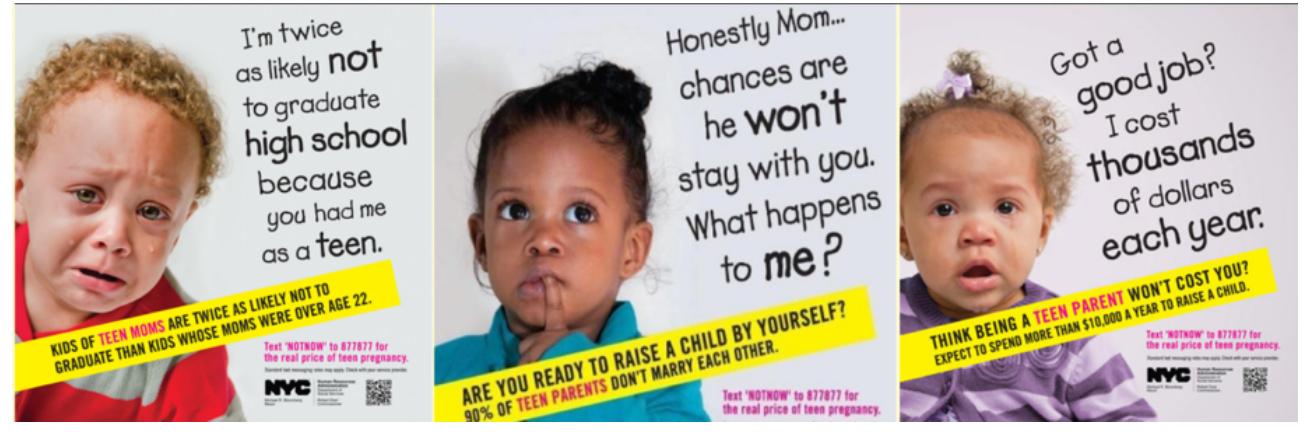
Figure 1. NYC 2013 Teen Pregnancy Prevention campaign materials.

The online ethnographic research method used here draws on adolescents' anonymous, voluntary, and intentional interactions with other online users in the exchange of information and advice about teen pregnancy in a popular social media site to answer the following research questions: Are the views of contemporary adolescents shaped by norms against adolescent pregnancy? If yes, how do US adolescents utilize, reproduce, or reinterpret these dominant narratives in their discussions of teenage pregnancy? In addition, how do these norms shape the lives of contemporary teens who experience pregnancy? Given the declining rates of teen pregnancy in the United States and the variation in pregnancy norms by time and context, this research allows for the examination of whether and how the people affected by these social norms—US adolescents—use, interpret, and experience social norms against teen pregnancy.