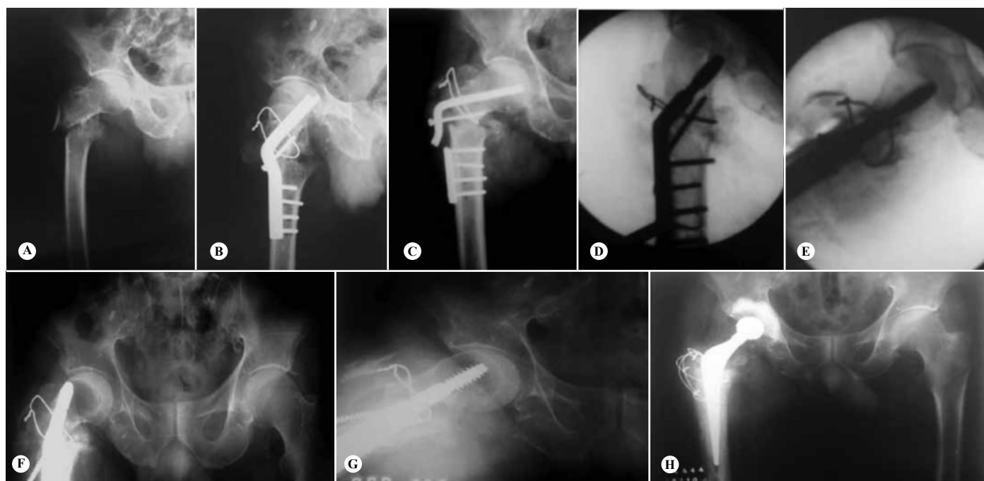
Figure 3 – 78-year-old patient with pseudarthrosis and failure of the material (A, B and C), who underwent osteotomy that was fixed with a DHS of 150° and valgization to 154° (D and E). After six months of follow-up without fracture consolidation or “cut out” of the material (F and G), it was decided to perform cemented total hip arthroplasty, which was achieved without intercurrents (H).

Fractures of the proximal femur are subjected to intense mechanical forces in small segments of bone, which reach 1250 lb/cm 2 of compression on the medial side and 1000 lb/cm 2 of tension on the lateral side, for every 100 lb (13) , thus requiring implants with trustworthy fixation. Consolidation of these fractures will depend especially on anatomical reduction and maintenance of the irrigation of the proximal femur, through the medial branch of the femoral circumflex artery. Other relevant anatomical data include the normal cervical-diaphyseal angle (between 124 and 136°) and the line that joins the center of the femoral head to the tip of the greater trochanter, which forms an angle of 90° (variation from 85-95°) with the mechanical axis of the femur (12-14) .