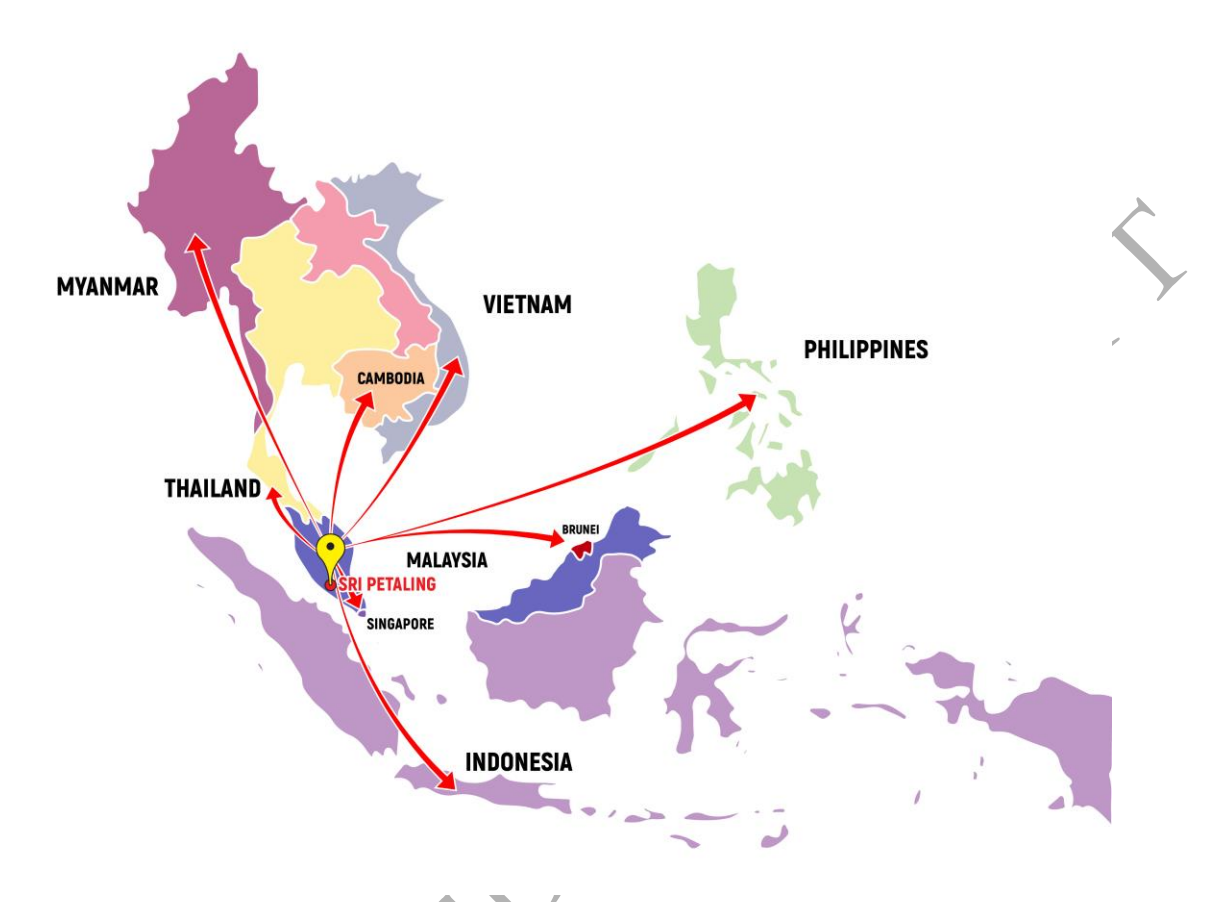
Figure 3: International spread of COVID-19 cases originated from Sri Petaling, Kuala Lumpur