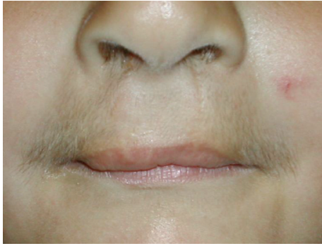
FIGURE 1: Upper lip of the patient at age 3 6/12 yrs. Note the moustache with dark pigmented hair over the upper lip and the scars of the cleft lip operations.

2.1. Biochemical and Hormonal Data. Hematological parameters and serum electrolytes were within normal limits. Early morning levels of adrenocorticotropine (ACTH: 26.8 pmol/L [ <22 pmol/L]; normal levels between [ ]), adrenal androgens (dehydroepiandrosterone 7.6 mmol/L [ <1.2 mmol/L]; androstenedione 1.26 nmol/L [ <0.9 nmol/L]); as well as of 17- \alpha -hydroxyprogesterone (72.7 nmol/L [ <1.0 nmol/L]) were elevated. Serum concentrations of cortisol (491 nmol/L) and testosterone ( <0.15 nmol/L) as well as plasma renin concentration (31.2 ng/L) were normal. After a 0.25 mg intravenous bolus of tetracosactide (Synacthen), cortisol levels increased slightly to 596 nmol/L, whereas 17- \alpha -hydroxyprogesterone levels increased to 140.8 nmol/L [ <6.0 nmol/L]. Baseline and stimulated 17- \alpha -hydroxyprogesterone levels were compatible with NCAH according to the nomogram of New et al. [9].