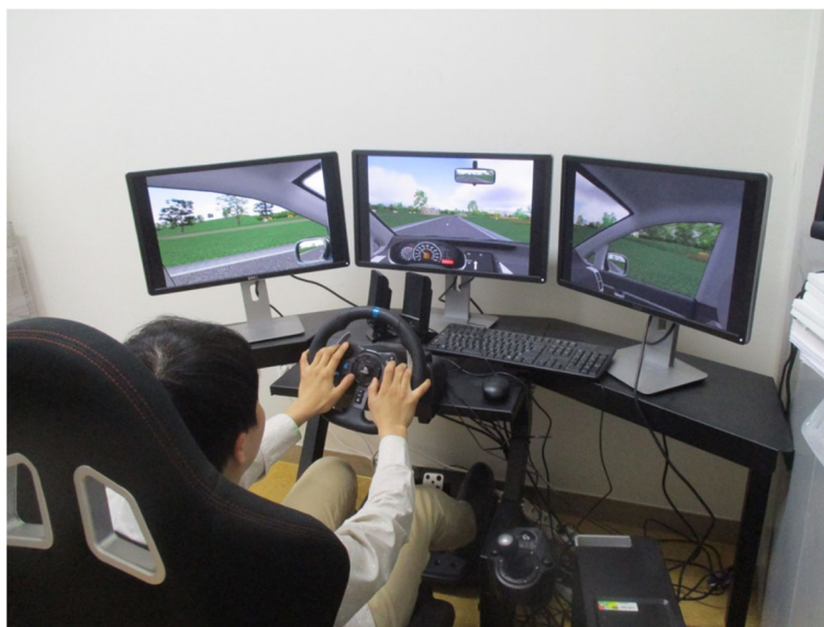
Fig. 1 Driving simulator set up with a patient in the femoroacetabular impingement surgery group driving at 1 week postoperatively

Overall, all patients participated in eight sessions of simulated driving during the course of the study. The index driving test was performed prior to the surgery to set the baseline. Prior to the test, the patients underwent detailed instruction sessions on what to expect during the simulation. The first postoperative driving test was performed when the patients felt comfortable on sitting on the driving seat and when they felt that they are ready to attempt simulated driving. The second postoperative driving test was performed on the 7 th day following the surgery, and the tests were repeated at weekly intervals for 6 weeks. On the day of the simulated