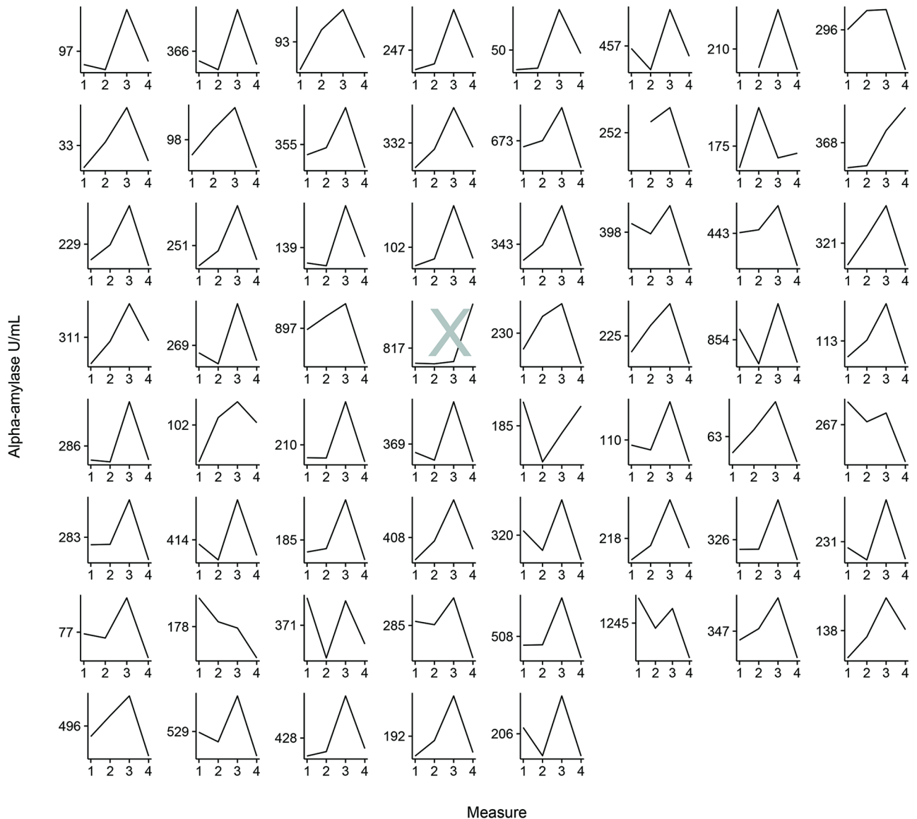
Fig 2. Individual plots alpha-amylase levels (U/mL) on four measurements surrounding the tandem skydive. The first measurement took place 15 minutes after the participant arrived at the skydive center, the second after they received the instructions and were ready to board the plane, the third immediately after they landed, and the fourth 20 minutes after they landed. The mean score of the four measurements is shown on the y-axis. The grey cross indicates a participant with an outlier on T4. This participant was removed prior to further analyses.

https://doi.org/10.1371/journal.pone.0204556.g002