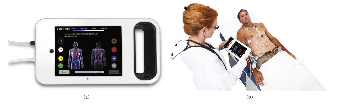
FIGURE 1: Data acquisition setup: (a) signal acquisition device and (b) patient and electrodes/lead placement and PPG configurations.

principles behind the technology, provide a description of the system and device, and discuss the study procedure, clinical data, and potential future applications.