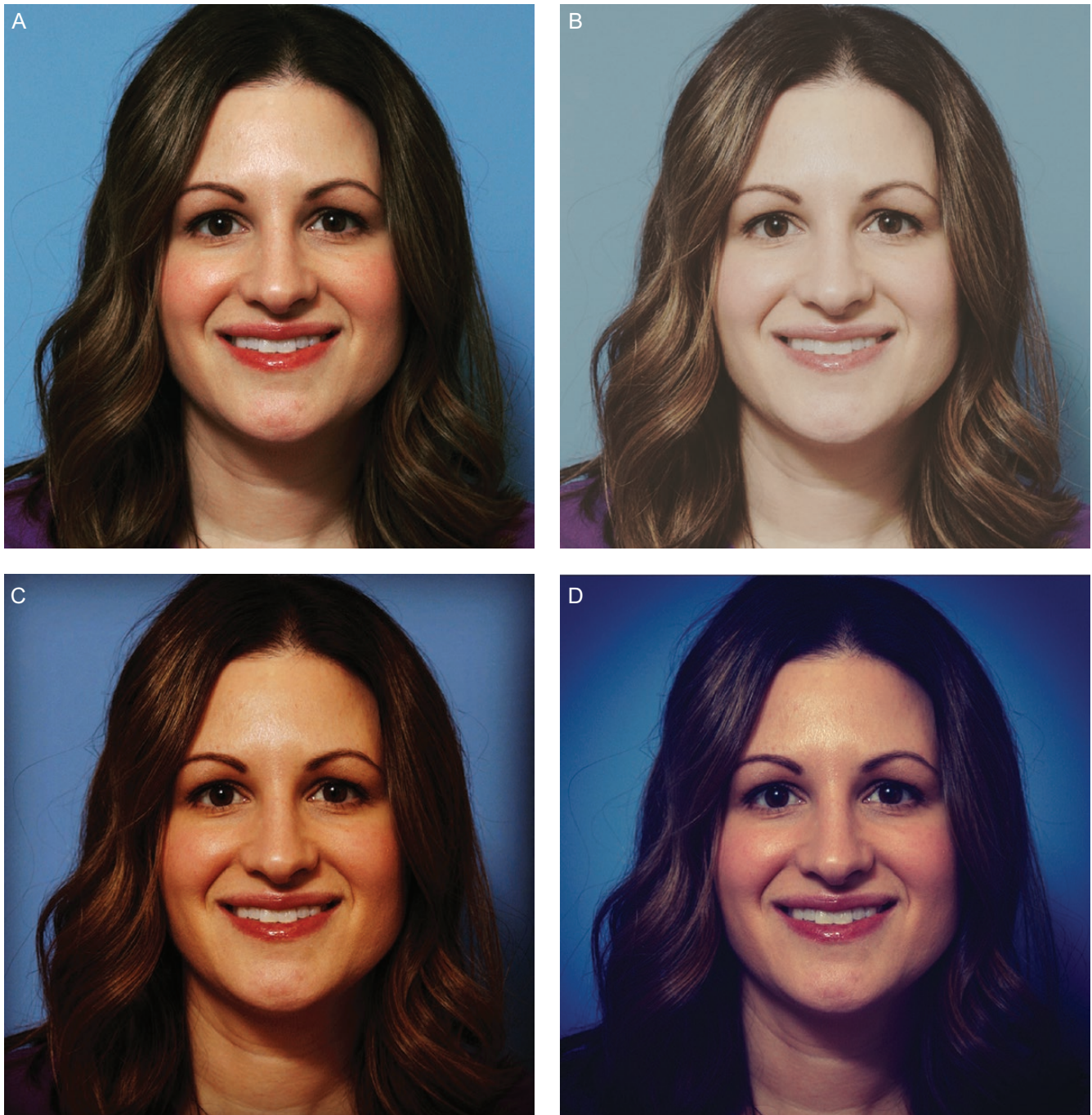
Figure 4. Subject 1, a 38-year-old woman. (A) Filtered photograph voted most flattering; filter: Juno. (B) Filtered photograph voted most youthful; filter: Reyes. (C) Filtered photograph voted least flattering; filter: Hefe. (D) Filtered photograph voted least youthful; filter: X-Pro.

unsurprising that this filter makes photos look most youthful because it erases wrinkles, reduces dark circles, lightens blemishes, and gives a smooth, even sheen to the face.