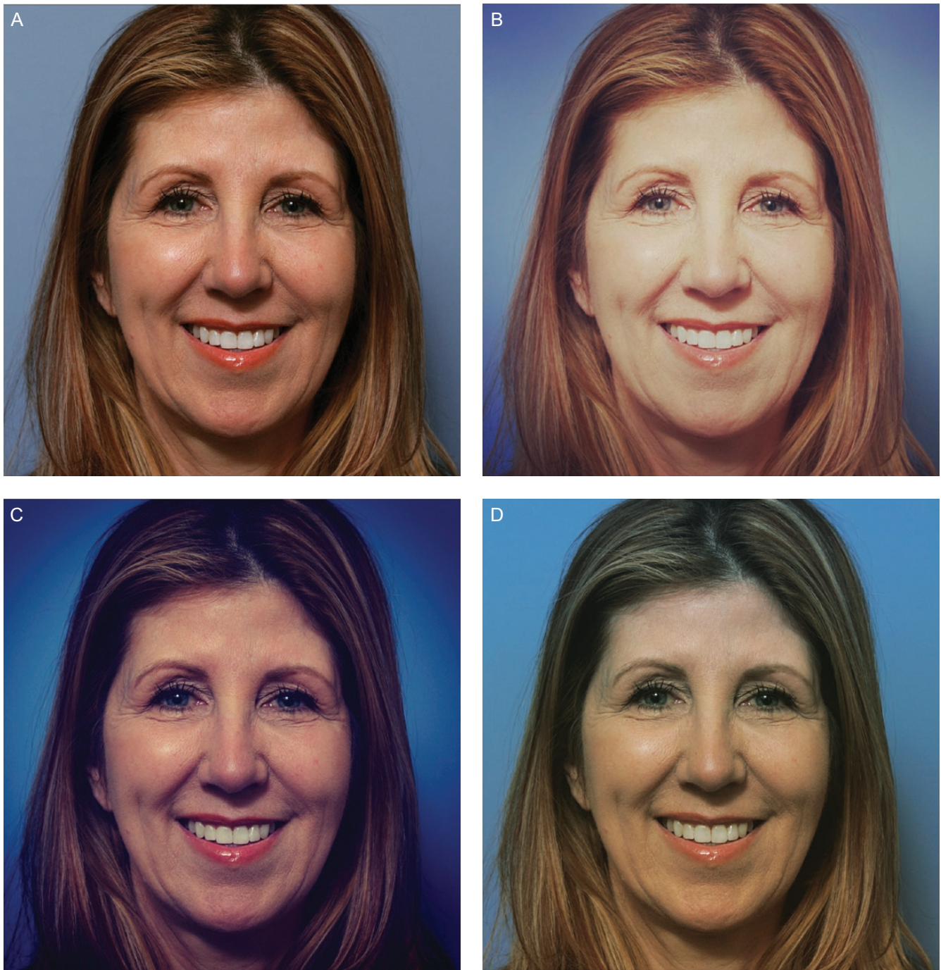
Figure 6. Subject 3, a 58-year-old woman. (A) Filtered photograph voted most flattering; filter: Ludwig. (B) Filtered photograph voted most youthful; filter: Rise. (C) Filtered photograph voted least flattering; filter: X-Pro. (D) Filtered photograph voted least youthful; filter: Perpetua.

to this narrow demographic. A future study involving males, different ethnicities and skin types, and more age groups will definitely yield more powerful data. The respondents were all female, and male respondents may have a different opinion of what is considered “flattering” or “youthful.” Finally, this study looks at overall trends in perception, which cannot necessarily be applied to each individual. For