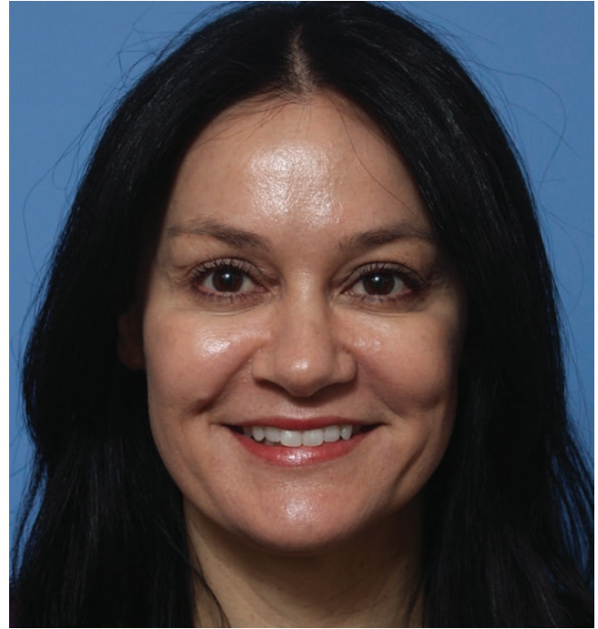
Figure 2. Unfiltered photograph of subject 2, a 48-year-old woman.

Instagram currently offers 20 different filters to choose from. But which Instagram filter is the ideal one and why? One study revealed the top 3 most popular Instagram filters were Clarendon, Juno, and Gingham, in that order. 1