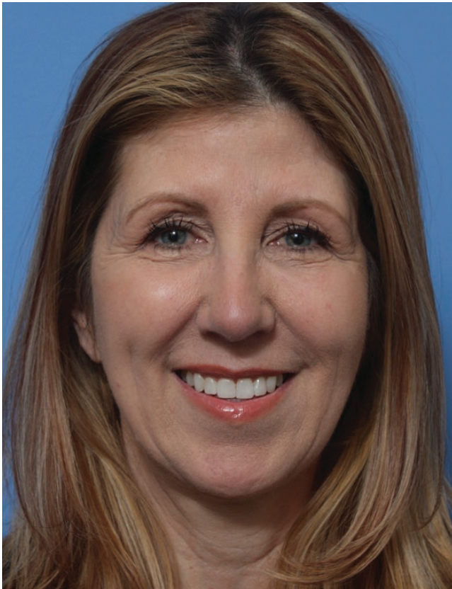
Figure 3. Unfiltered photograph of subject 3, a 58-year-old woman.

responding to the questionnaire. The study data were collected from November 2018 to April 2019.