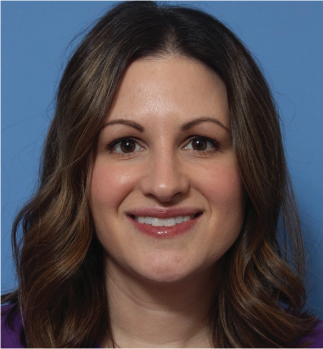
Figure 1. Unfiltered photograph of subject 1, a 38-year-old woman.

population. According to the annual Cosmetic Surgery National Databank Statistics from the American Society for Aesthetic Plastic Surgery, 5 the number of facial injectable treatments increased by over 33% from 2017 to 2018 in patients between the ages of 18 and 34. The American Academy of Facial Plastic and Reconstructive Surgery revealed in 2017 that facial plastic surgeons are reporting that more and more patients are bringing selfies with them to demonstrate their perceived flaws. 6