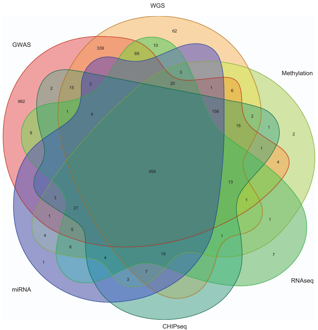
Figure 1. Overlap of the different layers of “omic” data. The venn diagram illustrates the extent to which the different layers of overlap in the ROS and MAP subjects that have been processed to date. 458 subjects have all layers of data described in this report.

variant calling, we ran the variant quality recalibration step in the GATK pipeline to empirically calibrate high quality variants. To ensure a high level of accuracy in genotype calls from sequencing, variants were filtered for minimum read depth (DP), variant calling confidence score (QD), VQSLOD and mapping and variant quality scores (MQ, GQ). Variant-level QC was performed using PLINK 15 which includes checking genotype concordance using previous GWAS data, excluding variants with excess and/or systematic genotype missingness, examining departure from Hardy-Weinberg Equilibrium and identifying Mendelian inconsistencies among related individuals. Variants were annotated using ANNOVAR 22 . Variants were annotated with population frequencies in existing variant databases including dbSNP, 1000 Genomes, and the Exome Aggregation Consortium (ExAC). Prediction of variant function was obtained from POLYPHEN 23 and SIFT 24 , cross-species conservation scores were obtained from PhyloP 25 , PhastCons 26 and GERP 25 and disease association were performed using OMIM 27 , HGMD 28 , ClinVar 29 .