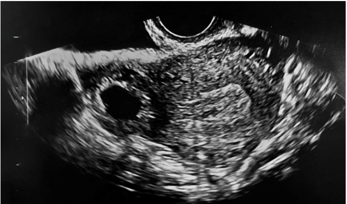
Figure 1. Transvaginal ultrasound showing the interstitial pregnancy.

surgery: physical and transvaginal ultrasound examination were regular and \beta -hCG serum levels became negative after 45 days.