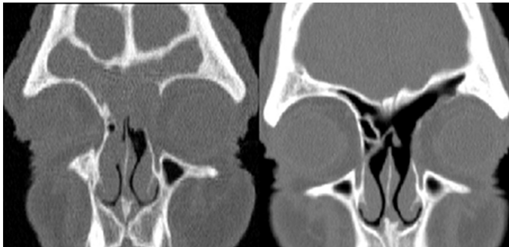
Fig. 7. Left: pre-operative and Right: post-operative scan after removal of inverted papilloma of patient in Fig. 6.

operative upper lid inflammatory changes indicating a breach in the floor of the frontal sinus and periosteum preoperatively. Both patients achieved an excellent cosmetic result (Figs. 4 and 5).