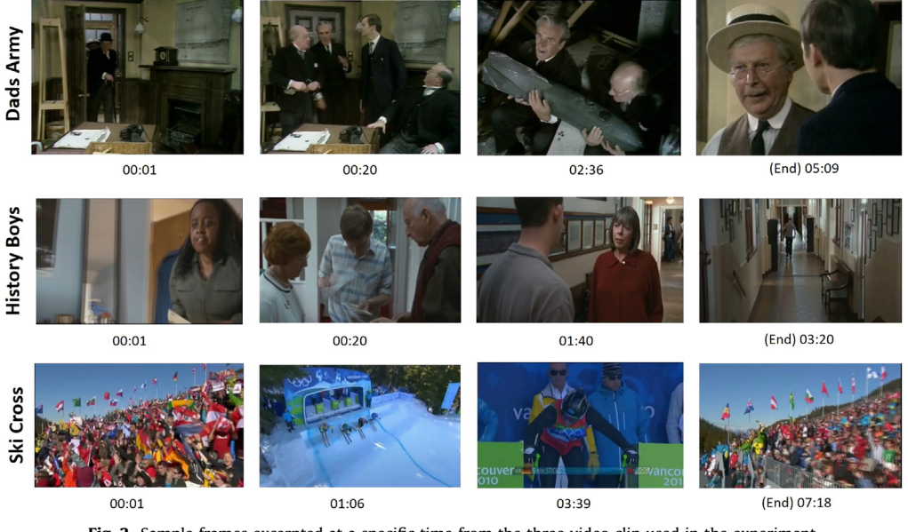
Fig. 2. Sample frames excerpted at a specific time from the three video clip used in the experiment.