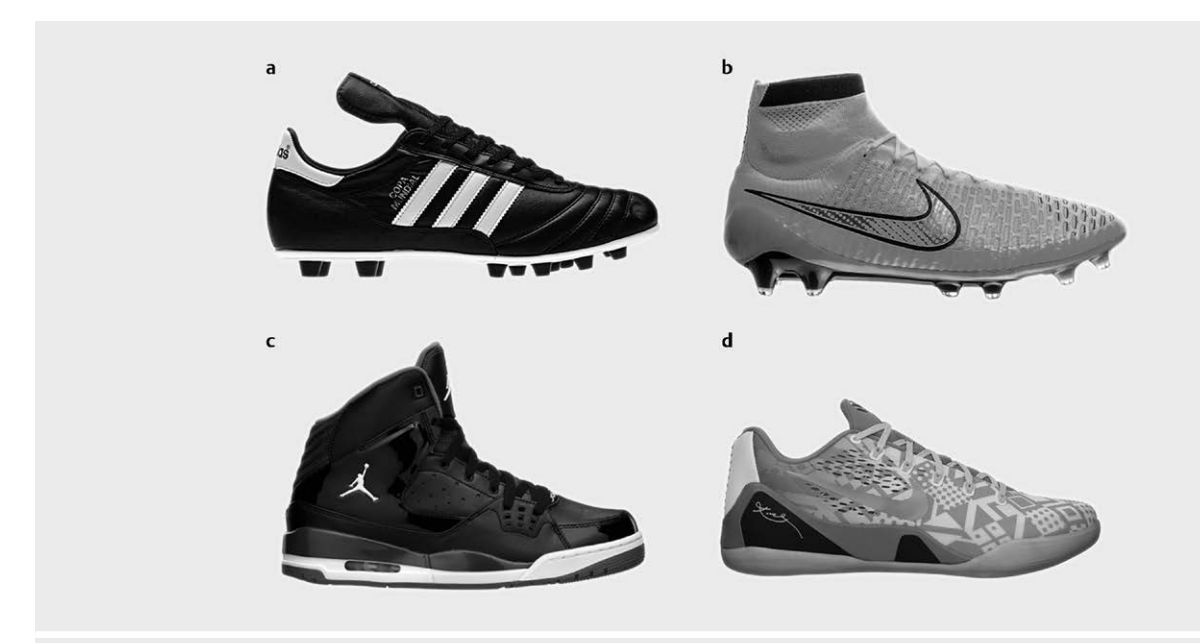
Fig. 4 a low-cut soccer shoe, b recent high-cut soccer shoe, c high-cut basketball shoe, d recent low-cut basketball shoe.

slight increase in instantaneous energy consumption. According to Wierzbinski [115] and Tung et al. [106], shoes with dynamic materials can be more efficient in terms of energy consumption than running barefoot. This result was confirmed by Franz et al. [34]: even if low shoe weight is generally related to low energy consumption, the shoe's mechanical properties with specific devices can ultimately obtain better energy efficiency.