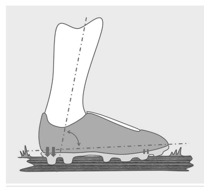
▶ Fig. 2 Schematic profile of a foot in a cleated shoes on natural grass. Tendency to dorsiflexion.

pears a vicious circle in which the functional limitation and the anatomical limitation are increased respectively.