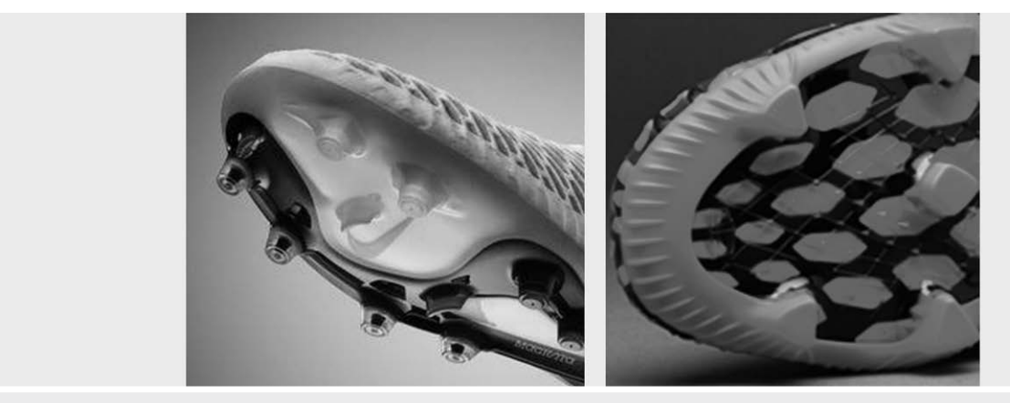
▶ Fig. 3 Pictures of recent models. Left, conical cleats. Right, polyhedra cleats without strong longitudinal component.