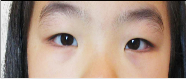
Fig. 1. The patient was orthophoric at distance.