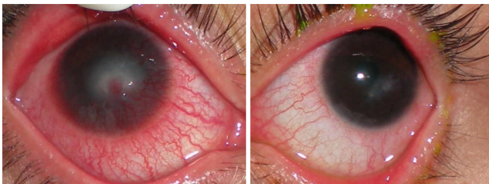
Figure 1 Corneal vascularization of the right eye (left photo) and left eye (right photo) before treatment with topical cyclosporin.

Her right eye condition remained the same despite intensive treatments. A trial with topical cyclosporin A 0.5% every 6 hours was decided on, which was the authors' first experience using topical cyclosporin for blepharokeratoconjunctivitis. There was a dramatic regression of corneal vascularization in both eyes after 3 days on topical cyclosporin (Figure 2). After 1 week of treatment, both eyes showed white conjunctiva with resolved corneal vascularization (Figure 3). Her visual acuity was markedly