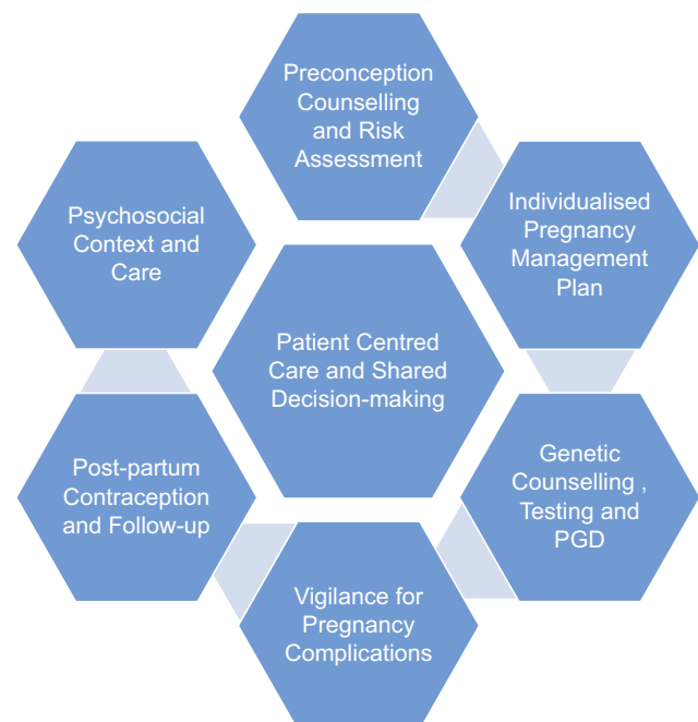
Figure 3 Suggested model of pregnancy care for women with ADPKD.

Previous research has described multiple themes in relation to patient perspectives on CKD and pregnancy, 43 including bodily failure, devastating loss and guilt at not achieving motherhood or gambling with maternal health. There are complex decisions when considering pregnancy, relating to women’s own health and survival, outcomes for their future offspring, including inheritance of genetic disease, and expectations of partners and families. Health professionals’ attitudes can lead to feelings of medical judgement and lack of support. Discussing the medical risks of pregnancy early in the disease course allows informed shared decision-making for pregnancy planning. Information provided needs to be well informed, up to date, and specific to women’s health/disease status. The challenge for the health professional is to balance discussion of medical risks sensitively with patients’ values of hope, autonomy and family. Disengagement of the patient can occur if the focus on risks and judgement predominate above hope and positivity. 43 A good therapeutic relationship gives health professionals the best opportunity to optimise medical outcomes. 44 See Figure 3.