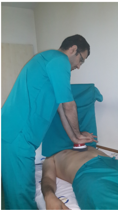
Figure 2 Pictogram for displaying the proper use of the device.

received, sex, age, intubation prior to CPR initiation, intubation during CPR, multi-organ dysfunction (respiratory, haematology, liver, cardiovascular, central nervous system, and renal), CPR shift, CPR duration, initial rhythm, first shock, biphasic shock, diagnosis, underlying osteoporosis, and frequency of conducted CPR. There were no important changes to methods after trial commencement. Information for invasive arterial monitoring and capnography wave was not reported as these procedures are not commonly available for patients.