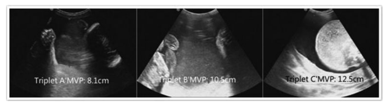
Fig. 2 Polyhydramnios was present in all three fetuses by 30 weeks. MVP, maximal vertical pocket.

TRAP sequence is a sonographic diagnosis. Findings include identification of a monochorionic multiple pregnancies in which one fetus has severe malformations, usually lacking a functional heart and a cephalic pole. Given its unusual shape and size, it has also been called the "acardiac acephalus" or