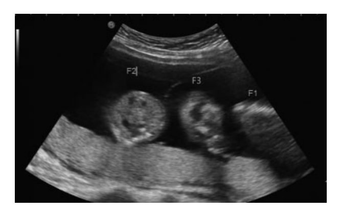
Fig. 1 Ultrasound images of a monochorionic-triamniotic triplet pregnancy at 17 weeks. The acardiac fetus is seen in the middle of the screen (F3). F1, fetus one; F2, fetus two; F3, fetus three.

monochorionic-triamniotic triplet gestation with two structurally normal fetuses and an acardiac triplet (Fig. 1). Detailed anatomy scan and fetal echocardiogram did not detect any structural abnormalities in triplets A and B. After extensive counseling; the patient declined pregnancy termination or selective fetal reduction of the acardiac fetus. The pregnancy was followed with ultrasound examinations every 2 weeks. At 24 weeks, triplet B developed polyhydramnios with an amniotic fluid maximal vertical pocket (MVP) of 11.9 cm; triplet A had normal amniotic fluid (MVP: 7.3 cm). Triplet C (the acardiac fetus) showed diffuse subcutaneous edema. By 30 weeks, polyhydramnios was seen in all three fetuses with MVPs of 8.1 cm (fetus A), 10.5 cm (fetus B), and 12.5 cm (fetus C, acardiac), respectively (Fig. 2). Doppler velocimetry of the umbilical artery, middle cerebral artery, and ductus arteriosus were normal for triplets A and B, and there was no evidence of fetal hydrops. The patient received an empiric course of antenatal corticosteroids for induction of fetal lung maturation at 30 weeks.