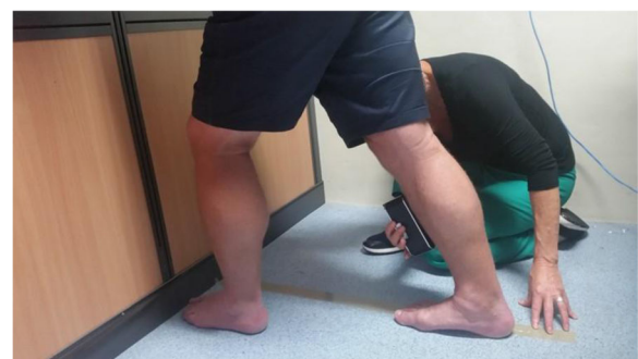
Fig. 1 Measurement technique for the weight bearing Lunge test with knee extended using a digital inclinometer (Bear Digital Protractor 82201B-00, China)

A Lunge test with the knee extended and an inclinometer (Bear Digital Protractor 82201B-00, China) placed on the mid-point of the anterior border of the tibia, between the tibial tuberosity and the anterior joint line of the ankle, was used to determine WB ankle joint dorsiflexion range of motion (Fig. 1). The test was completed three times, with 10 s rest between tests, and the average score was documented as the test result. The authors have previously shown this method to have excellent intrarater (ICC = 0.83 to 0.89) and interrater reliability