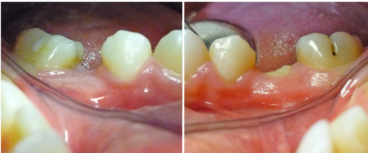
Figure 1. View of the premolar regions from both sides.

Radiographic examination of the jaws revealed the presence of mandibular second premolars