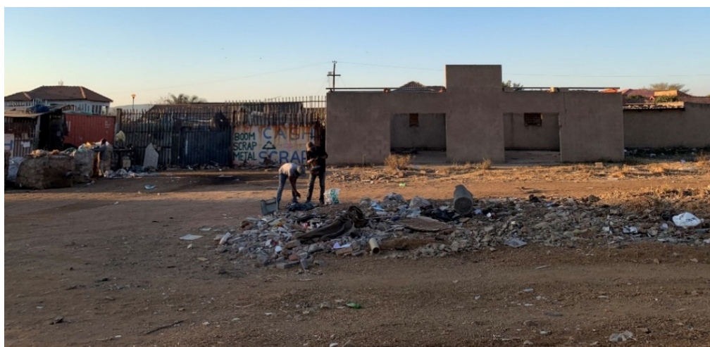
Figure 2. Waste dumped on the side of the street in an informal settlement.

Among a large sample of households living in low-income communities, solid waste was reported by many respondents as being collected on a weekly basis by the municipality, and yet up to 10% of households said they disposed of waste in other ways, such as dumping in the street (Figure 2)/yard, and/or burning or burying waste in the yard. Several reasons for these anomalies may exist despite a formal waste management system existing. For example, other studies suggest that formal waste collection can be erratic in low-income communities and despite weekly collection being mandatory by the government, it does not always occur weekly [4,35]. Reasons for this include a lack of resources or capacity within municipalities and challenges with suppliers [36].