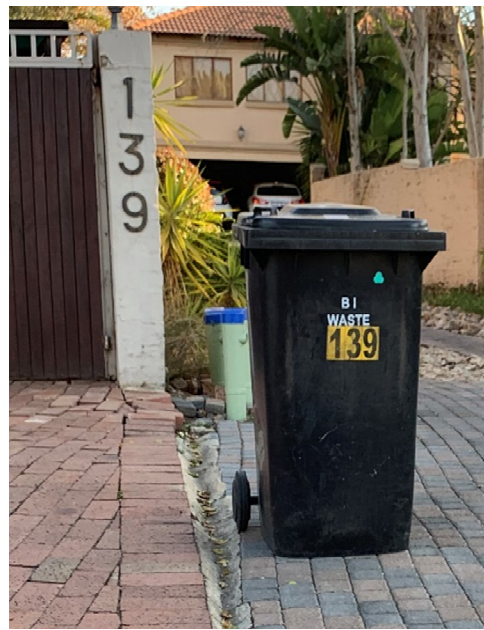
Figure 3. Illustration of a municipal-issued wheelie bin to a formal dwelling.

According to the 2018 General Household Survey [37] 3.9% ( n = 190,476 ) households in Gauteng make use of their refuse dump (possibly on-site/in the yard), while 2% ( n = 97,680 ) of households dump or leave waste “anywhere”. Considering that low-income households generate between 17.2 and 22.6 kg of household waste per week [38], approximately 5763 tons of waste per week is not collected leaving 288,156 Gauteng households potentially at risk of exposure to domestic solid waste because of improper waste management practices. Media reports dating back to 2011 refer to giant rats roaming the streets of Alexandra, a low-income area in Johannesburg. The rats feed on discarded food waste and place people, especially babies and the elderly, at risk of contracting rat-bite fever, other diseases, and even death [39–41].