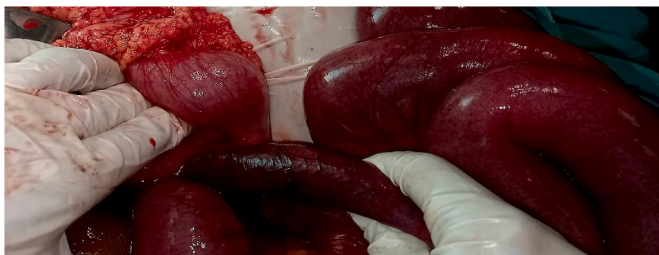
Figure 2. terminal ileum and the right colon intussuscepted in the left colon.