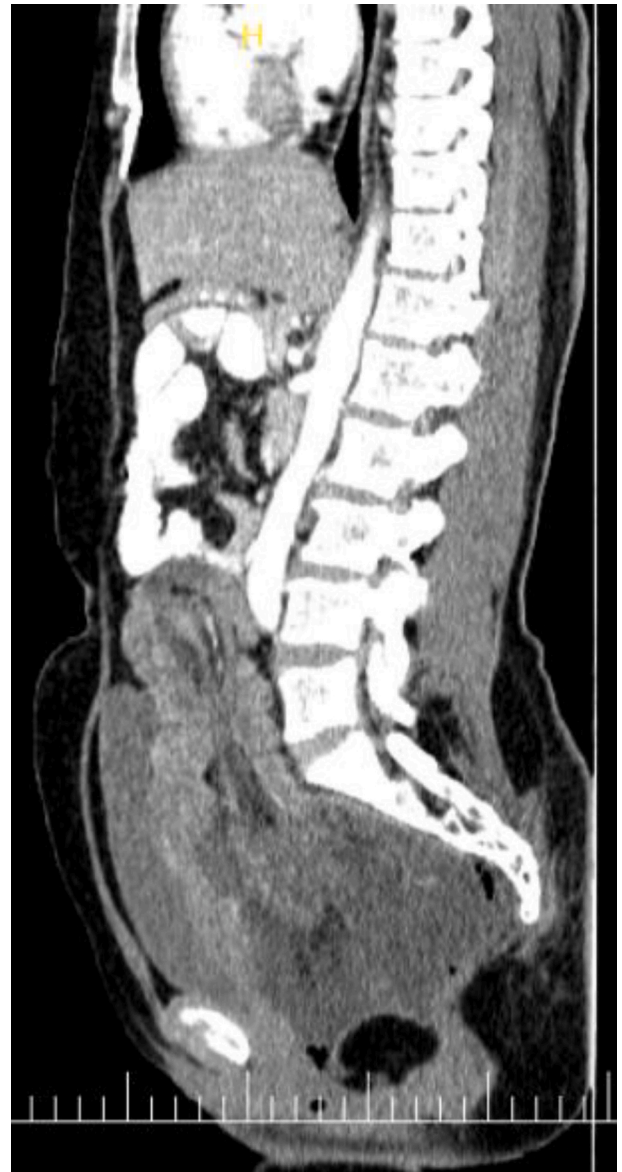
Fig. 1. B Axial CT scan shows a round mass of fat density representing lipoma within the lumen of the rectum.

intussusception due to cecal lipoma [8]. Robertson et al. reported a cecal tumor that chronically impacted the rectum and the leading point was cecal adenocarcinoma [9]. Ongom et al. reported a case of anal protrusion of ileocolic intussusception with no identifiable leading point, bowel laxity, and no hepatocolic or splenocolic ligaments [10]. These patients underwent right hemicolectomy and primary ileocolic anastomosis; however, our patient had an extended right hemicolectomy and ileostomy due to intestinal dilation and intra-operative abdominal contamination.