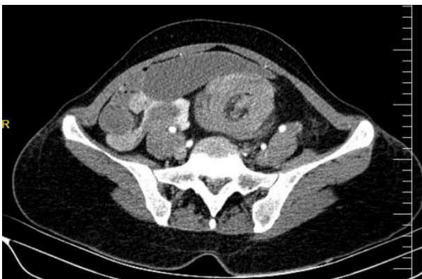
Fig. 1. (A) Axial CT scan shows left mid abdominal colocolic intussusception as a target-like mass.

Although generally, Gastrointestinal lipoma is rare, even colonic lipoma is rarer, and the incidence of colonic lipoma is reported a range between 0.035% and 0.4% [6]. Colonic lipoma is prevalent in late middle-aged women between 50 and 60 years of age and the ascending and transverse colon at 38% and 22%, respectively [7]. We present a case of colorectal intussusception and prolapse in the rectum due to cecal lipoma. Less than five cases were reported in the literature related to entire ileorectal intussusception. Apposition of ascending colon to the retroperitoneum and exteriorization with failure of ascending zygosis that did not stop the intussusception was observed in these cases. Similar to our case, Bensardi et al. presented a patient with entire ileorectal