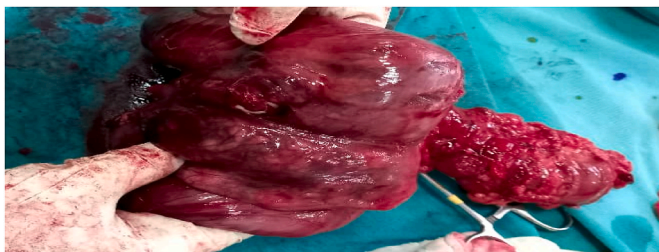
Figure 3. After reduction of the cecal mass.