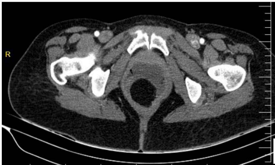
Fig. 1. C Sagittal CT scan shows very large colocolic intussusception as a bowel-in-bowel sign with an intussuscepted lipoma in the rectum.