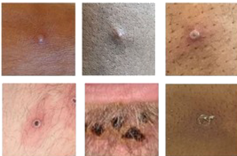
Fig. 2 The monkeypox rash – phases of evolution through papular, vesicular and umbilicated stages before crust formation and desquamation.

To date, children aged under 10 years represent a large proportion of monkeypox-related deaths, ranging from 100% of documented fatalities in the period 1970–1999 to 37.5% over 2000–2019. 1 In children, presentation with oropharyngeal monkeypox lesions and nausea or vomiting has been associated with extended hospitalisation. 20 Severe manifestations – including