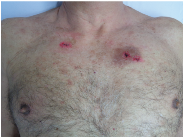
Figure 1. Bruise-like patches on the chest.