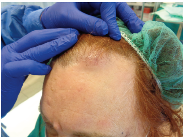
Figure 2. Erythematous nodule on the forehead.