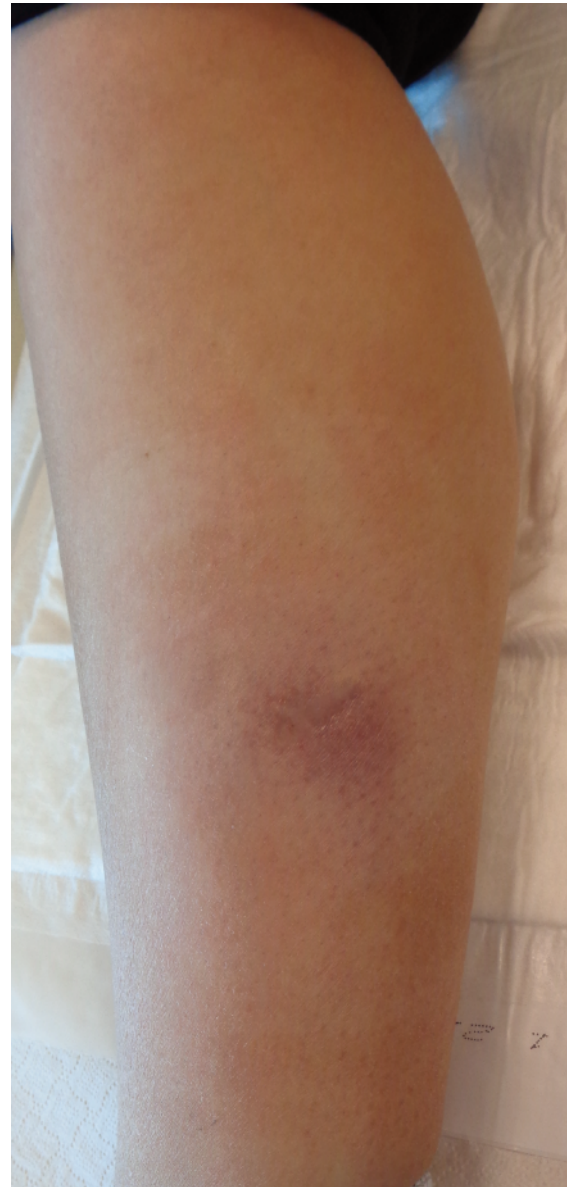
Figure 3. Subcutaneous plaque mimicking erythema nodosum.

The actual and definitive definition of BPDCN was finally given in the 2008 edition of the World Health Organization (WHO) classification of Tumors of Hematopoietic and Lymphoid Tissues. 11-13 Since its first report in 1990 by Tauchi et al. , BPDCN