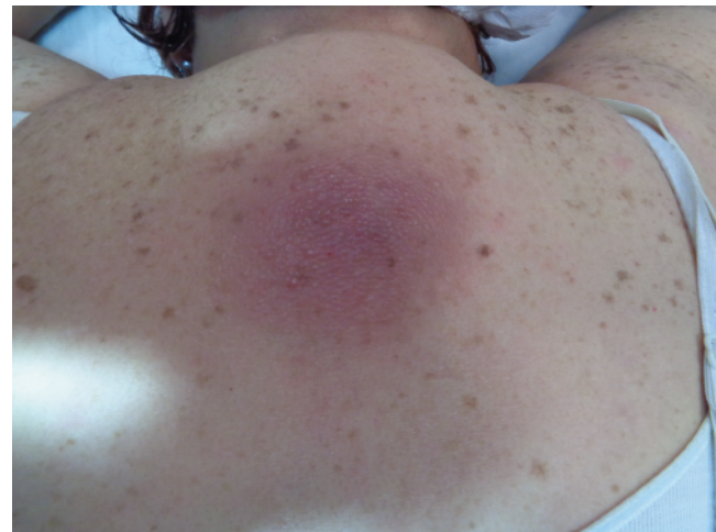
Figure 4. Abscess-like nodule on the back.