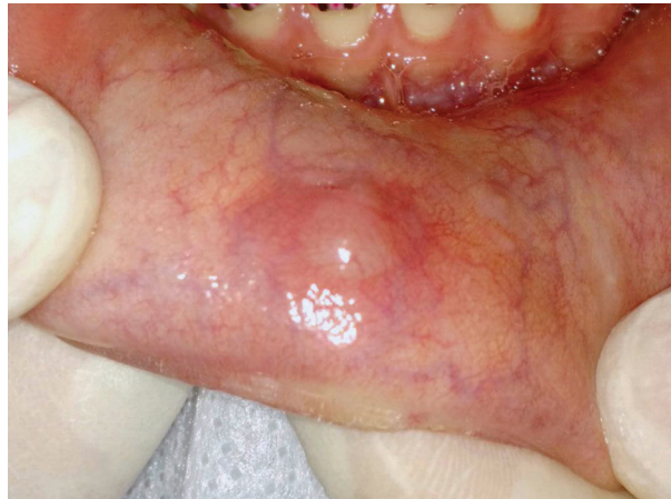
Fig. 1: Nodular mass at the lower lip.

A 20-year-old female with no medical history presented with a 2 cm x 1 cm painless nodular mass on the lower lip with trauma due to an orthodontic treatment (Fig. 1). The tumor was excised under local anesthesia, with a suspected clinical diagnosis of mucocele, and submitted for histopathological examination. Histologically, the lesion showed an exophytic papillary proliferation composed of well-differentiated stratified squamous epithelium, which merged with a glandular proliferation occupying the submucosa (Fig. 2). The stratified squamous epithelium in the exophytic portion was hyperplastic with hyperkeratosis, parakeratosis, and focal hypergra-